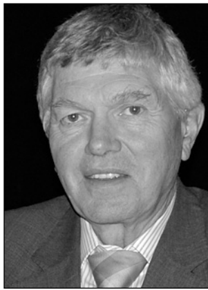
Energy Minister Mel Knight

"Alberta is a leader in committing substantial resources towards the development of traditional and new