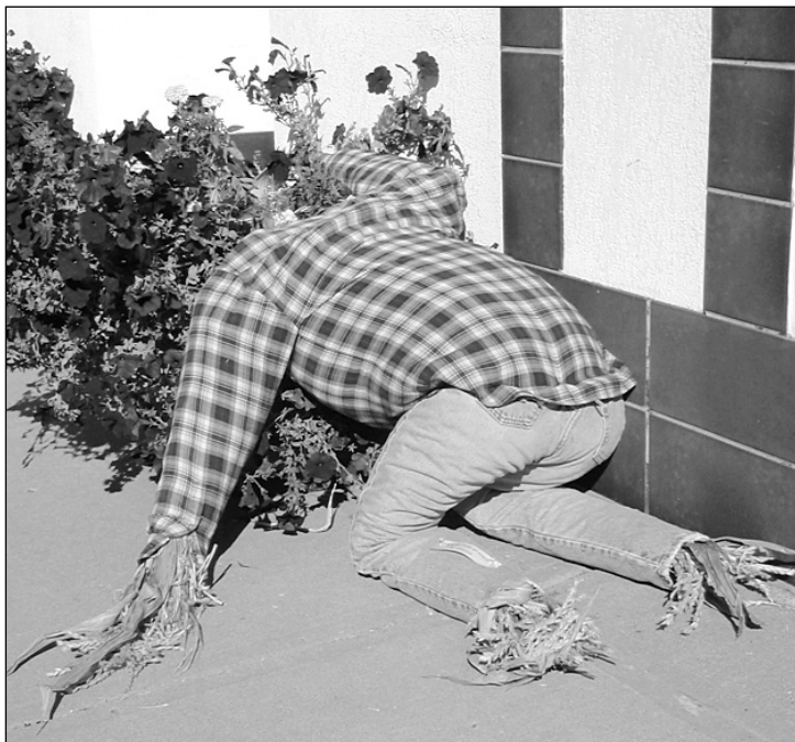
This guy, (really a scarecrow), found on Main Street is making the time to stop and smell the flowers.