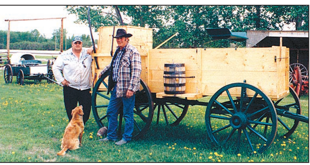
Two men stand beside a wooden wagon while a dog waits patiently for their next move.