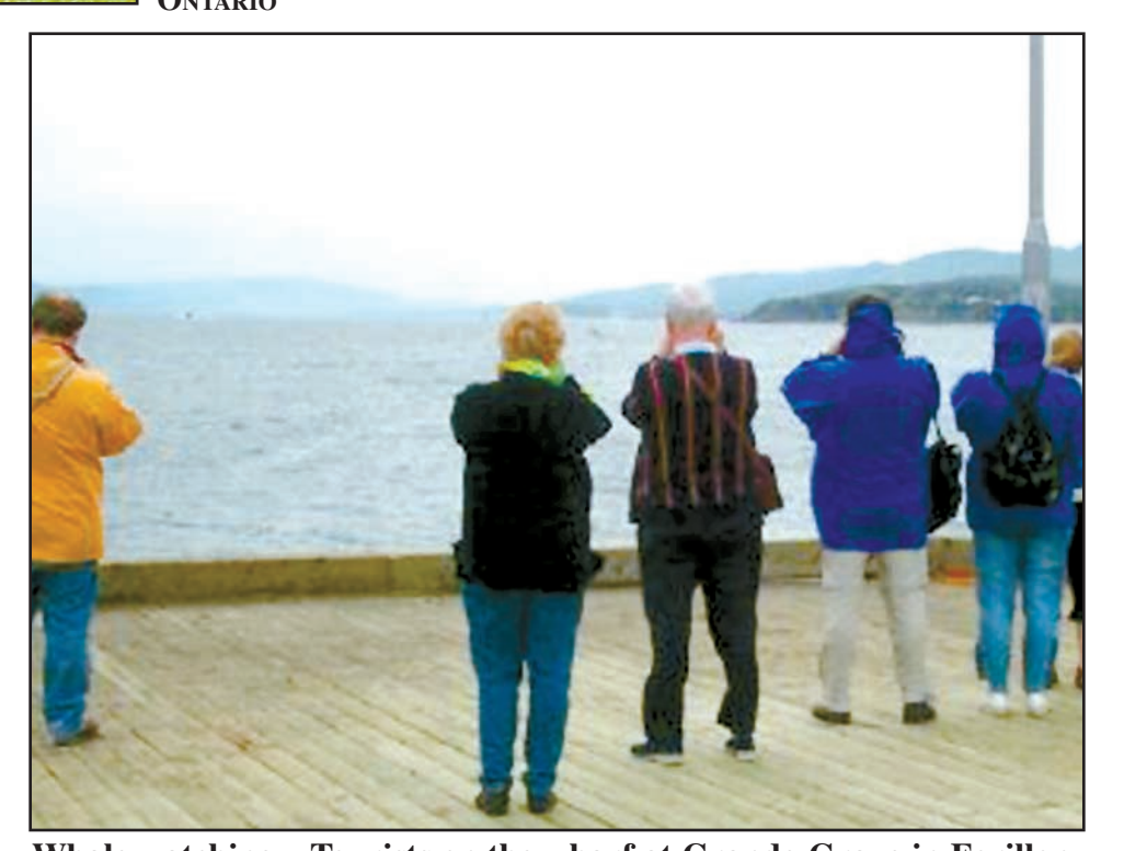
Whale watching—Tourists on the wharf at Grande-Grave in Forillon National Park have their binoculars trained on the water, hopeful that a whale will appear Photo by Charlene Eden, Spec Reporter, Gaspe Peninsula, Quebec.