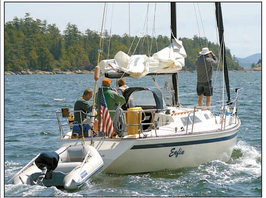
American boaters leave Ganges Harbour on Wednesday after visiting the island where tourism is the number one industry.