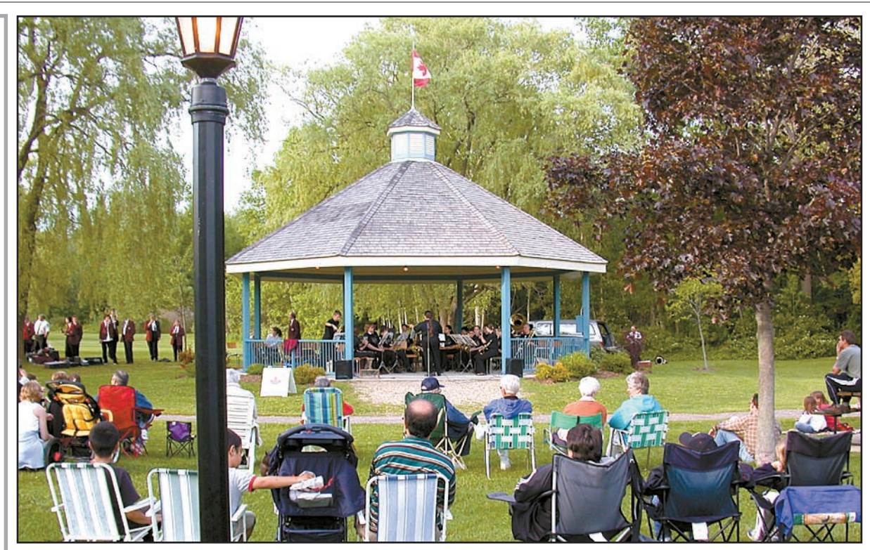
Ayr, Ontario—The Ayr-Paris Band gets ready for a concert in Centennial Park in Ayr. The Junior Band shows their skills ahead of concert. on Wednesday evening.