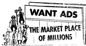
—Or even this:

Going in this week is another new machine known as a Nolan Super Caster, which is a stereotyping machine, also electrically heated and temperature controlled by thermostat. This new machine replaces an old style kerosene heated casting box. This equipment casts pictures and illustrations in metal from a paper matrix (or mat) producing a stereo and a product from this new Supercaster could look like this: