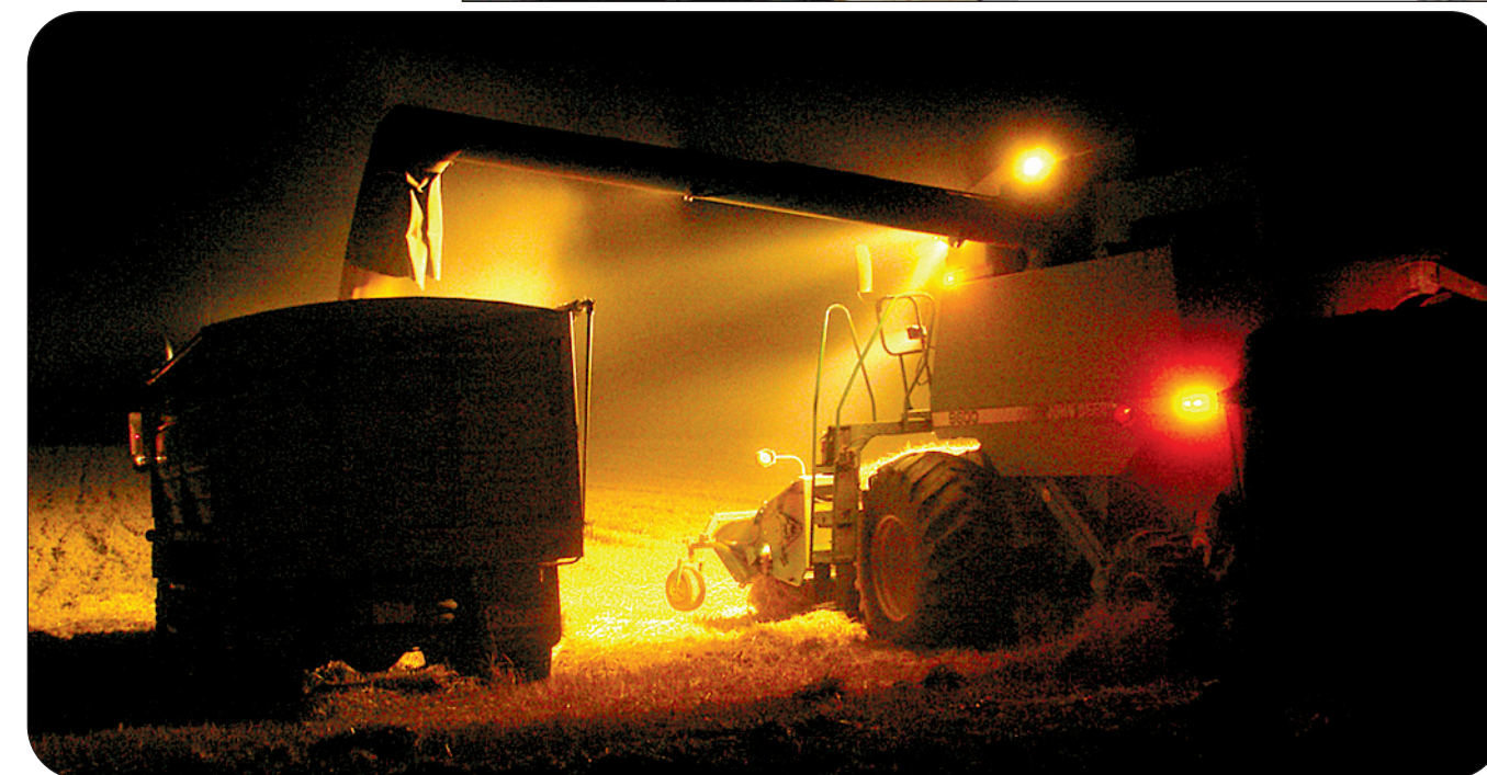
While the machines drone into the black of night . . .