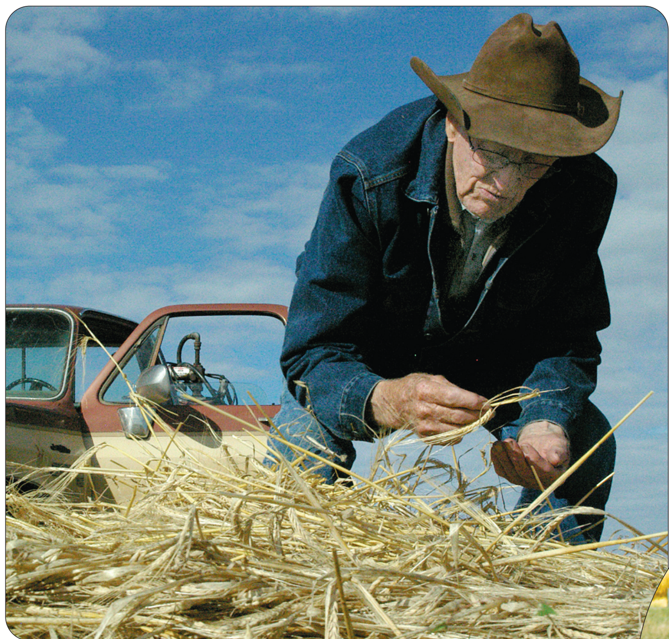
A good hard look—and a sample taste of the barley crop passes inspection.