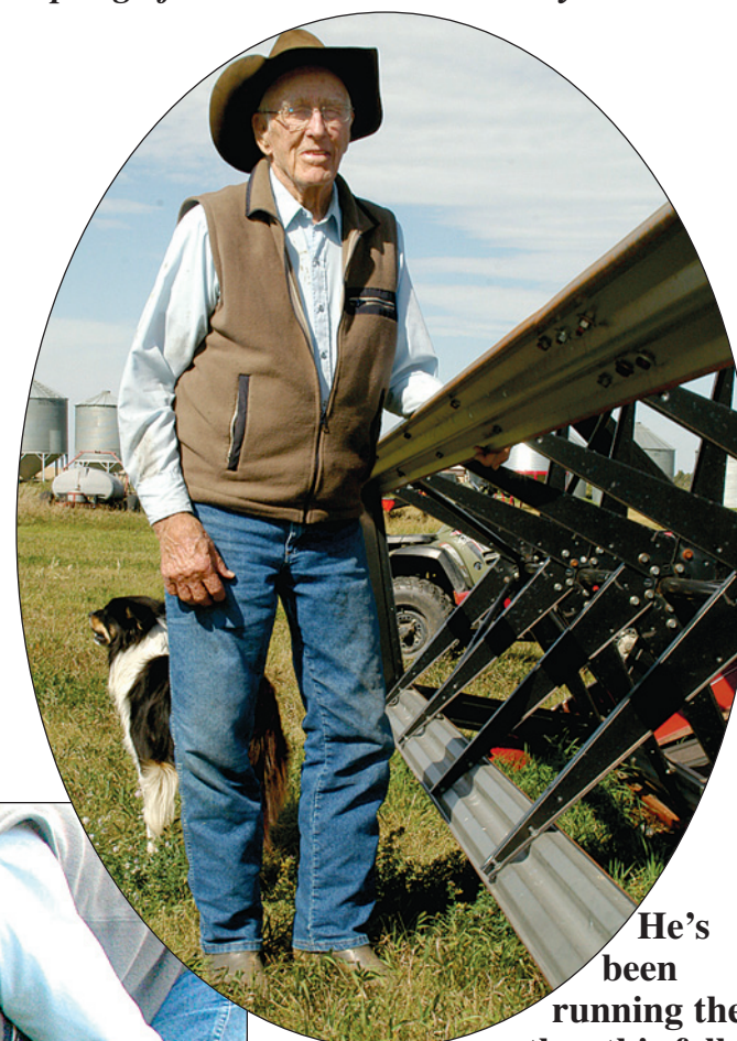
He's been running the swather this fall; "Pupper" at bottom left, is a welcome companion.