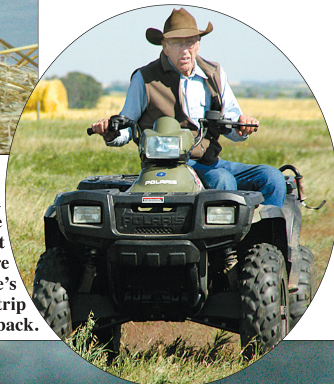
Throwing a cane into the back of this unit because of sore knees, there's nothing to a trip out back.