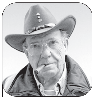
Bouncing Around with Pudge