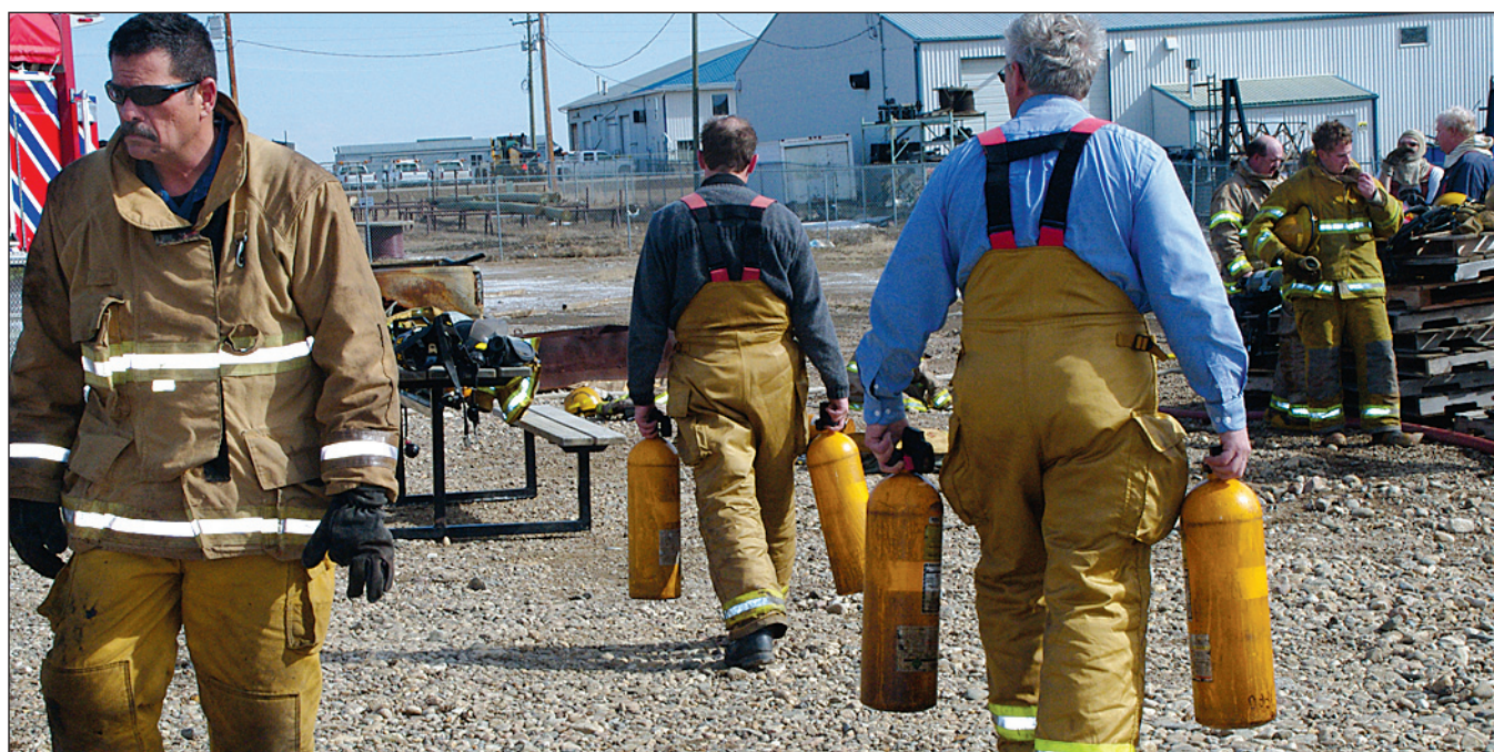
Fresh tanks of air are carried to the training centre behind the fire hall.