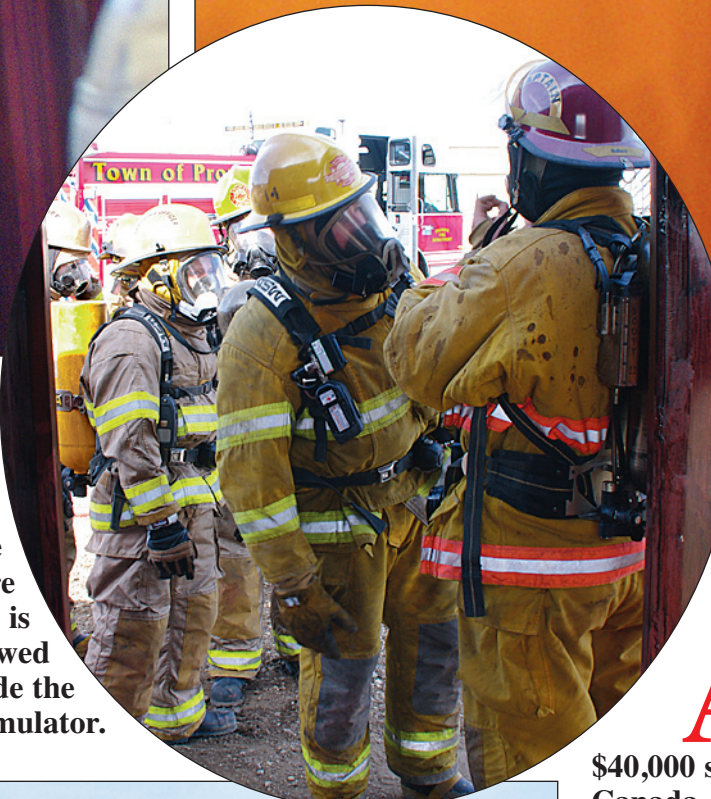
Safety checks are made before anyone is allowed inside the simulator.