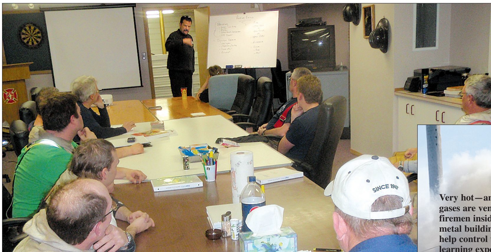
Classroom instruction deals with theory and what to expect in the training building where visibility at times is virtually zero.