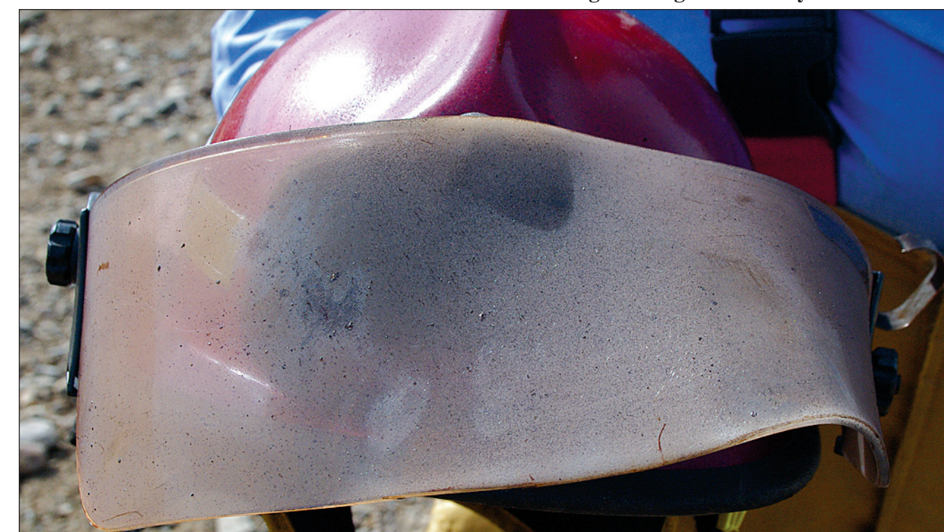
More than one fireman's visor was melted beyond repair during the intensive—and ultra hot training sessions.