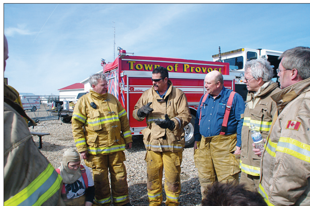
A last minute review takes place before another session gets underway.