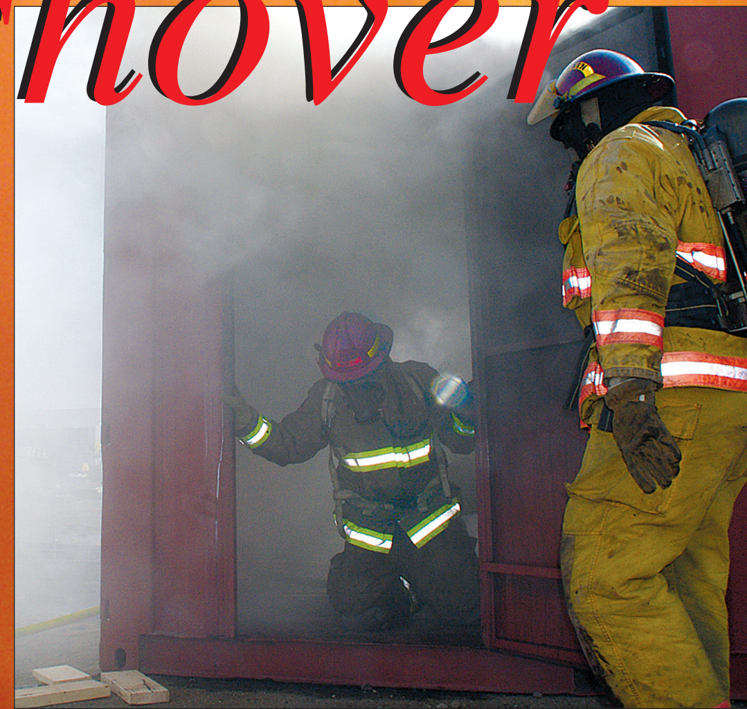
Firemen were trained not to stand up—even when leaving the steel building to avoid serious burns.