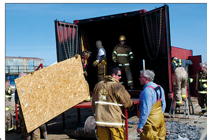
More sheets of plywood are loaded into the training building on Saturday afternoon.

A high intensity training program was held at the Provost Fire Department Training Facility—designed to prevent serious burns using a new $40,000 simulator that few other rural departments have in Canada. The live fire and hot training sessions were held on Saturday and Sunday, March 20 and 21. The News photographer was invited to suit up and capture scenes from both outside and inside the new metal building where temperatures reached 300 degrees for those sitting near the floor. If anyone stood up during a portion of the exercise he or she risked being severely burned with what's called a potentially deadly flashover event. The rolling balls or fingers of fire did appear on the ceiling and the picture taken above by the editor showed what was moving silently just a few feet above his and firemen's heads. Story on page 1.