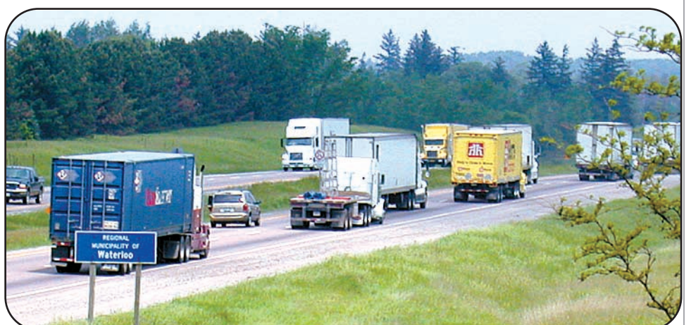
Ontario's main thoroughfare, Highway 401, on a slow day. Photo taken at north end of Ayr, Ontario .