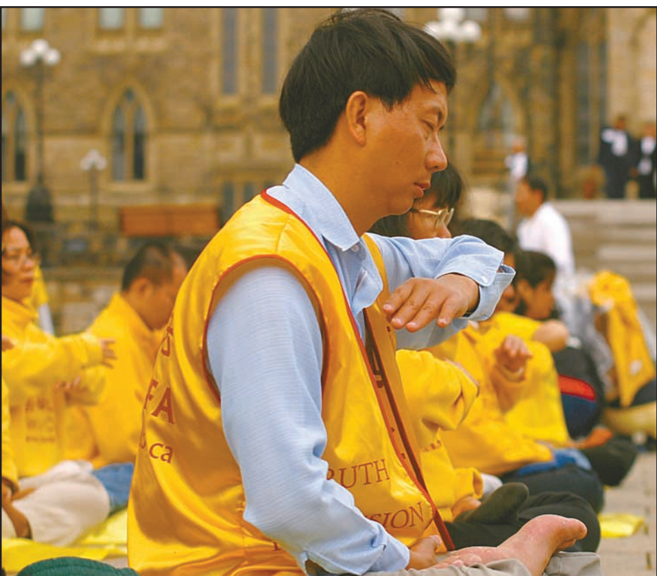
Hundreds of Falun Gong members from Ottawa, Toronto and Montreal rallied on Parliament Hill Wednesday. They want to bring Jiang Zemin to justice for the murder and torture of Falun Gong members in China. The peaceful practitioners sent a petition to the PM's office with 50,000 signatures.