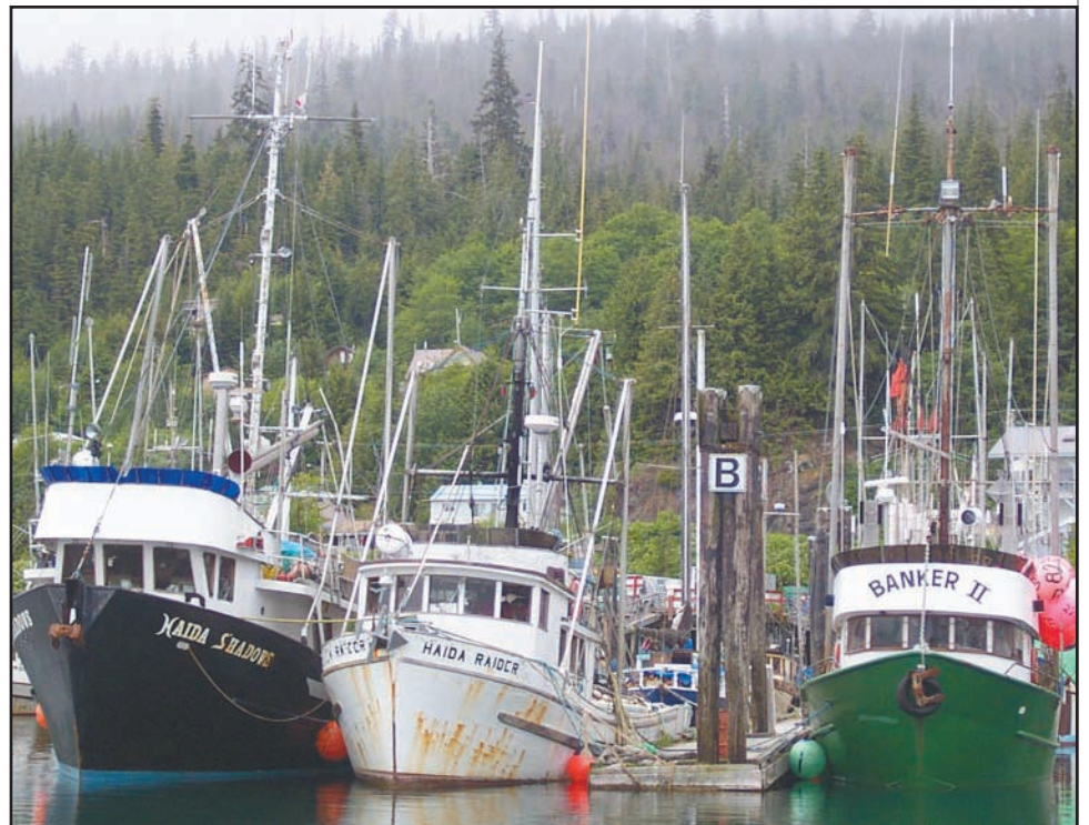
A tranquil view of the floats (harbour) in Queen Charlotte.