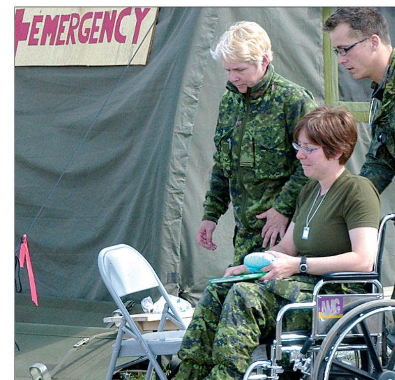
A wheelchair is used to move a woman away from a tent marked "Emergency."