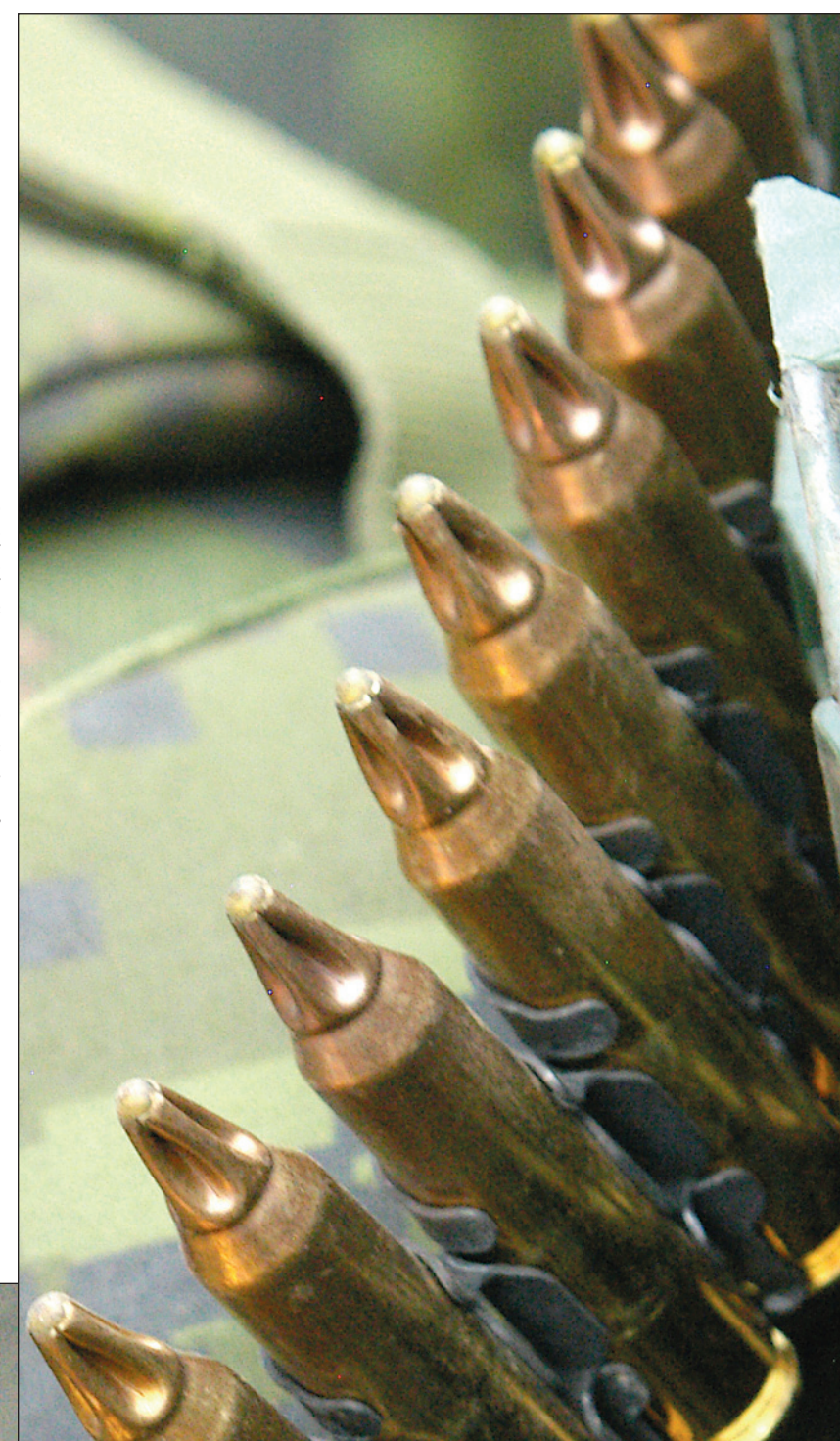
Ammunition was left out in the open as exercises were under way.