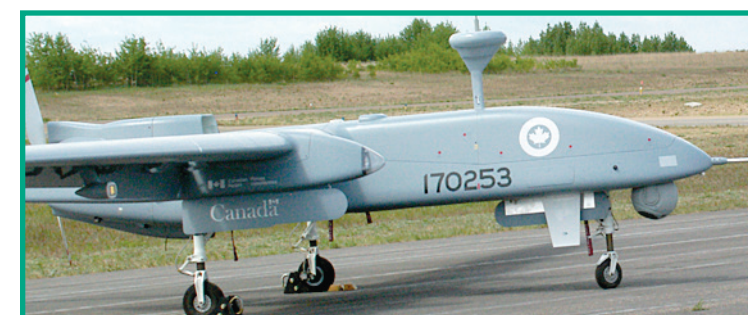
This drone, used for gathering intelligence, was made in Israel and is now being flown without a pilot for training here in Canada. Others like it are in the air over Kandahar province, Afghanistan.