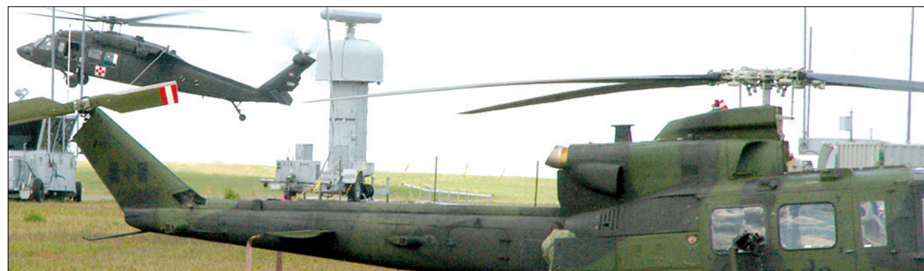
A helicopter lifts off during a mission.

Members of Canada's military have been preparing for a mission to Afghanistan this fall with planners laying out parts of a training area as troops may find it and other landmarks when they get to Afghanistan. Some hired civilians have been hired to dress and speak as Afghanistans citizens. Even a landing strip has been re-created to the north west of the Provost M.D. to look like the real one where other Canadian troops are now serving. These pictures show some of the activity that has been taking place.